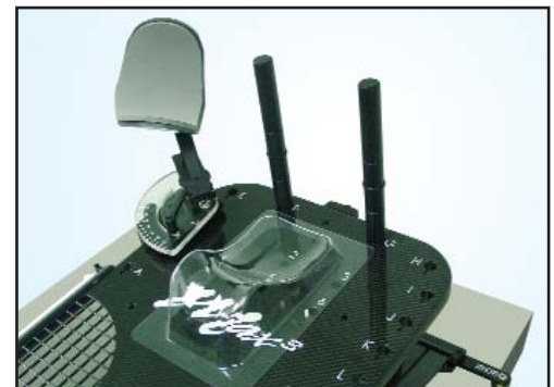
Optional calibrated arm and wrist cups securely lock in place.